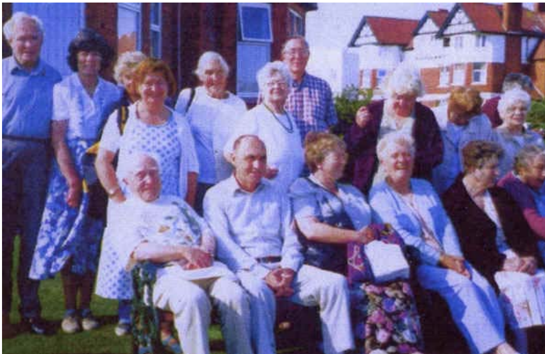
'Catholic Concern For Animals' at Rhos On Sea, summer 2000

The above is just the latest kind of price I've become accustomed to paying over the years, for either my own outspokenness or for possibly being an embarrassment to any cause that may not have been as void of diplomacy as myself. But then, in contrast to priests who went through daily motions of ritual and sacrifice; who amongst the prophets was ever diplomatic?