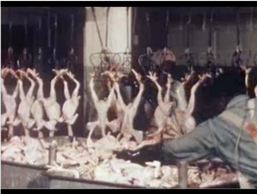
Post World War II poultry processing facility.

On most farms in early 20th century America, it was the women and children who largely looked after the flock. Apparently it was deemed emasculating for men to be poultry caretakers. As a result, “early poultry extension programs were aimed at appealing to farm women”. 7 But this would change as poultry farming, like many other forms of animal agriculture, began to scale-up, introduce higher stocking densities, new technologies and automation to increase yields and improve profit margins to benefit the collectivization of the industry. The 1920’s and 30’s saw scientific research facilities emerge in an effort to increase egg-laying capacity through breeding and genetic manipulation programs. Many of these facilities also served the industry by developing vaccines to help curb the unintended consequences of such programs - disease.