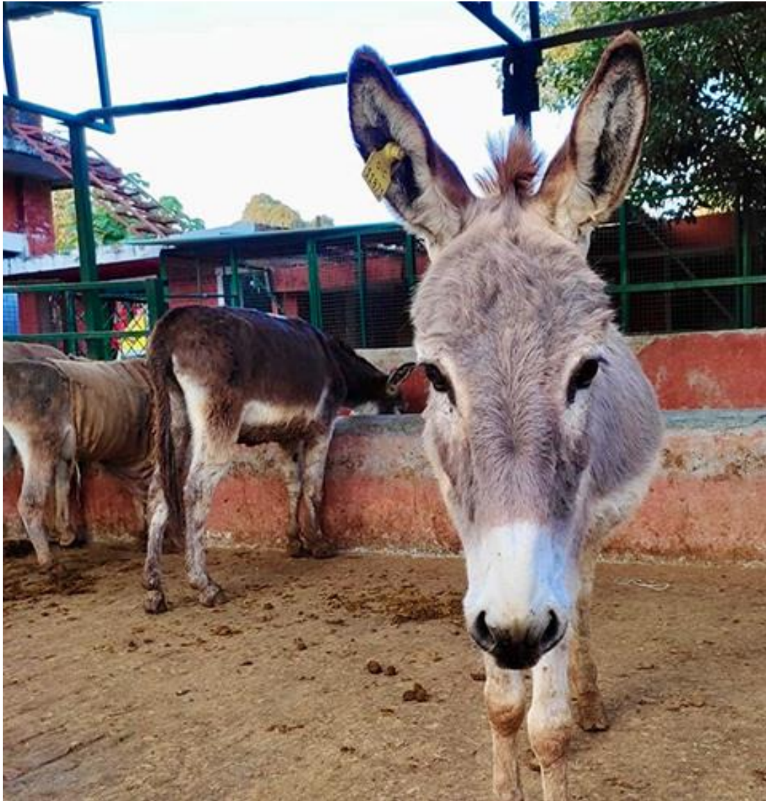
Rescued for life sanctuary animals

Gulzar (above), along with many of his friends, was made to work for hours on end at a construction site. After being rescued, he, and his friends, now live in peace and comfort at our grantee's shelter RaahatforAnimals in Dehradun.