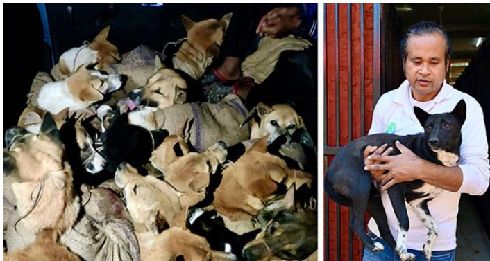
Three illegal dog meat operations busted!

It was then that we decided to find a family for her. We approached many families but none was willing to take her in. We then decided to shift her to our sanctuary in Aurangabad where there are many patients like her she could make friends with and she can live happily 'til her last breath.