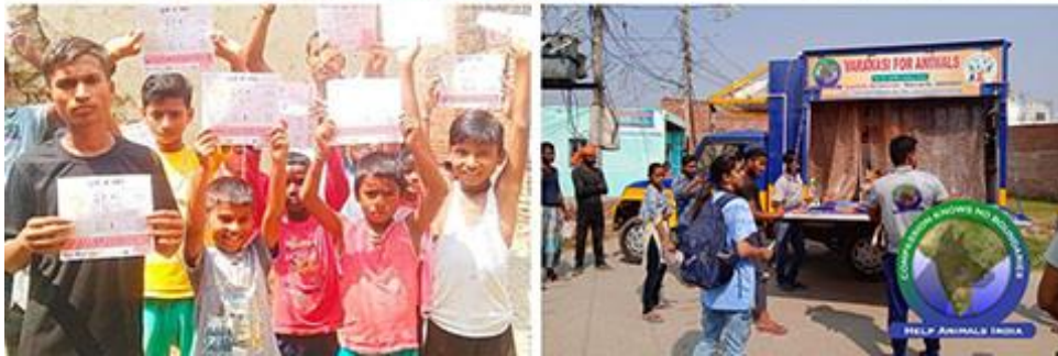
Community education and real help to the animals with our one of our mobile vehicles!