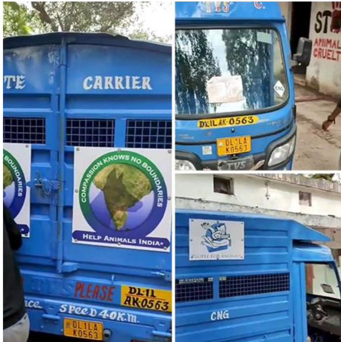
Another new animal ambulance!

Our ambition is to reach the less well known places of India where animal advocates are eager to help more animals. Here a small rescue vehicle was donated for PFA (People for Animals) Durg Billai (located in the east Central district of the state of Chhattisgarh - population exceeding 1 million.)