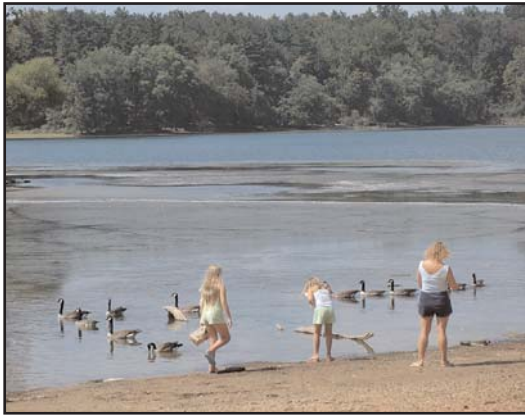
Public education lets people know why it's in everyone's best interests to let geese forage for themselves.

health and can increase the spread of diseases, such as avian cholera, avian botulism, and “duck plague,” among geese and other birds.