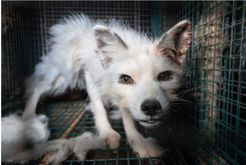
Fox fur farm

Environmental destruction, cruelty and risk to human health – just some of the damage that fur farming inflicts