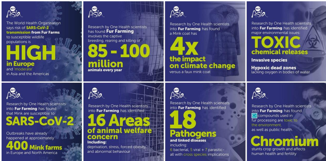
ACTAsia created infographics to illustrate the latest research by One Health scientists

The west has seen a sharp reduction in the use of fur in fashion but Asia still continues to use fur as part of their fashion offering. Not only are animals kept in inhumane conditions and killed for their fur, but fur farms also have a damaging impact on the environment . However human health is also at threat from fur farms. One of the most important – but least known – reasons as to why we need to see an end to fur farming is the threat to global health. This is due to the impact of zoonoses – viruses that jump from animals to humans. During the covid pandemic millions of animals were culled as a result of harmful zoonoses. Indeed, a recent research paper has revealed that fur farming represents significant threat to human and animal health, linked to at least 18 potentially deadly infectious diseases.