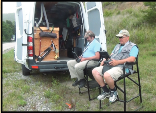
SHARK drone pilots on site, documenting cruelty