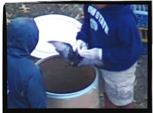
Children are often used to capture and kill wounded birds at pigeon shoots

While other animal groups have either abandoned or betrayed the pigeons in PA, SHARK has stood resolute in our defense of them. The pigeon shooters are so scared of SHARK showing up and filming them that they have been driven underground and limited the number of shoots they hold. This has saved tens of thousands of birds every year.