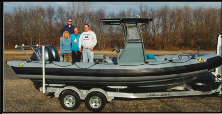
SHARK's boat, the Bob & Nancy, has been used on many important campaigns to save lives, including for cownose rays and cormorants

What you have read in this mailer is just a part of what we do; every day we are working on tips, researching, planning campaigns and producing videos exposing animal abuse. We are active 7 days a week, day and night, traveling across our country, fighting to save lives. No one does what SHARK does, but it is incredibly expensive to maintain this level of activism.