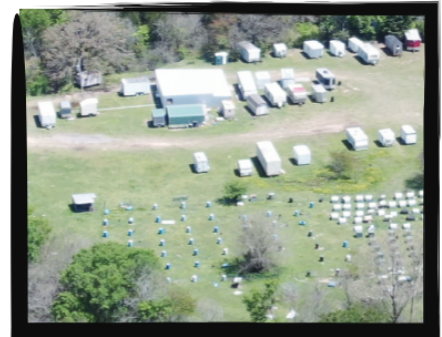
The cockfighting property, taken with our drone. The small boxes at the bottom are where the roosters are kept.

With your help , we continue to monitor this and other known or potential cockfight properties in Oklahoma and elsewhere and we will shut down many more cockfights!