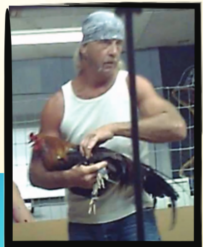
Undercover video from the Newcomb cockfight in Ohio. The rooster has razor-sharp blades tied to his legs

SHARK's campaign to crush cockfighting is the most comprehensive, forceful and successful effort ever in the history of the animal protection movement to shut down these vile and disgusting fights. It's been a hard journey fraught with danger, violence and threats, but with your help we continue to fight on.