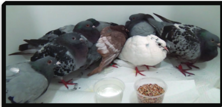
Just some of the many dozens of wounded pigeons SHARK has rescued over the years at pigeon shoots

The main pigeon shoot SHARK focused on in 2021 was the notorious Philadelphia Gun Club. A SHARK investigator filmed a number of shoots at the gun club, capturing horrific acts of animal cruelty and a complete disdain for human life, as the wealthy and politically connected members of the gun club openly flouted COVID restrictions that were in place. These sociopaths just didn't care about anything other than slaughtering small birds for fun.