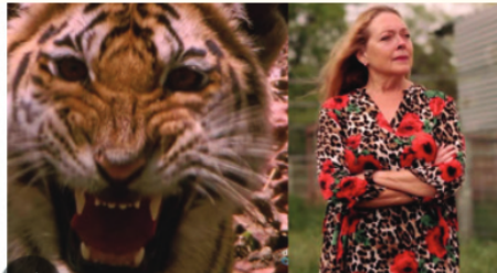
Carole Baskin of Big Cat Rescue

In November, some of SHARK's drone work was featured in a docuseries on Discovery+ entitled Carole Baskin's Cage Fight , as well as in the Netflix series Tiger King 2 (Ep. 4).