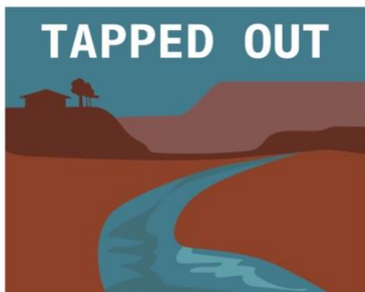
Power & water justice in the rural West

Ghost cattle — 200,000 made-up heifers. A massive fraud rocking eastern Washington’s arid ranching communities, leading to criminal charges and bankruptcy. The Church of Jesus Christ of Latter-day Saints and a Bill Gates-owned company duking it out at the auction block, each willing to spend more than $200 million to buy 22,500 acres of ranchland and its associated water rights.